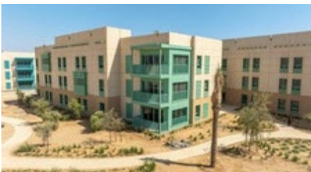
Amaala Village Red Sea Global - K.S.A.