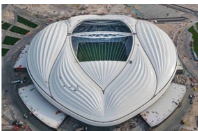
World Cup Stadium Al Wakrah