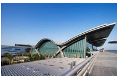
Hamad International Airport