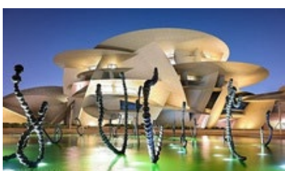
Qatar National Museum