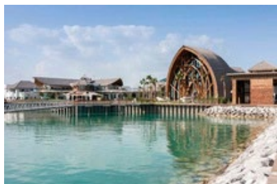
Anatara Banana Island Resort