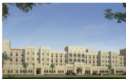
Internal Security Forces Camps