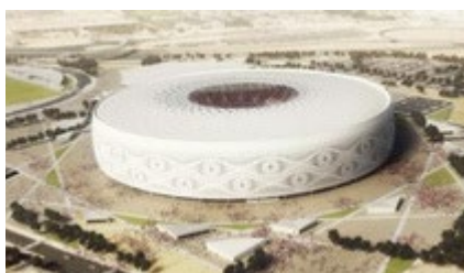
World Cup Stadium Al Thumama