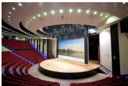
Souq Waqif Theater