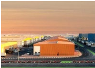
GWC Logistic Village