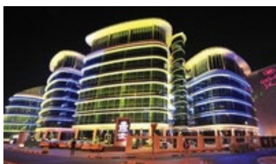
Holiday Inn Hotel the Business Park