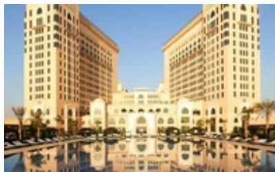
St Regis Hotel