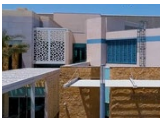
Al Maha Center for Children & Young Adults